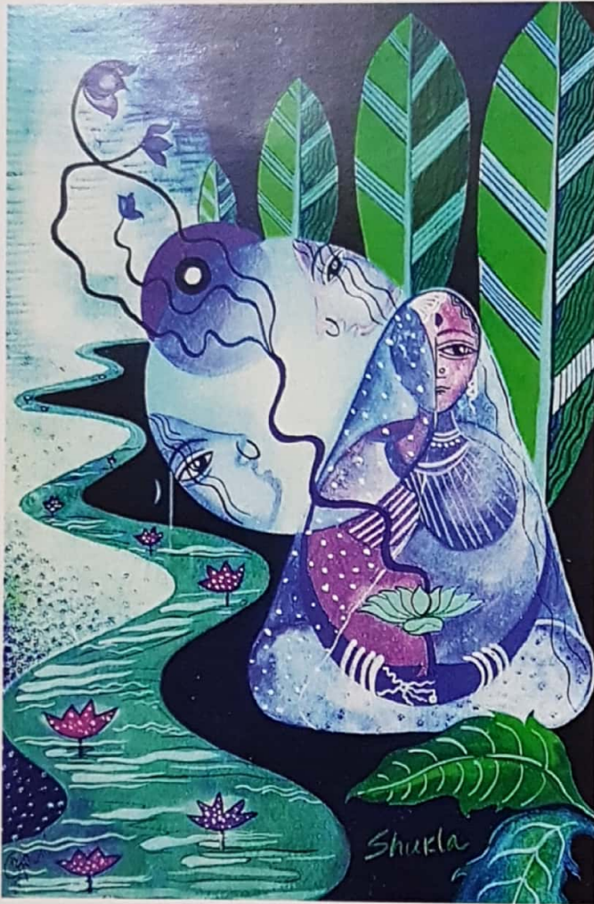
Srishti | 14" x 18" | Tempera on Chinese Paper