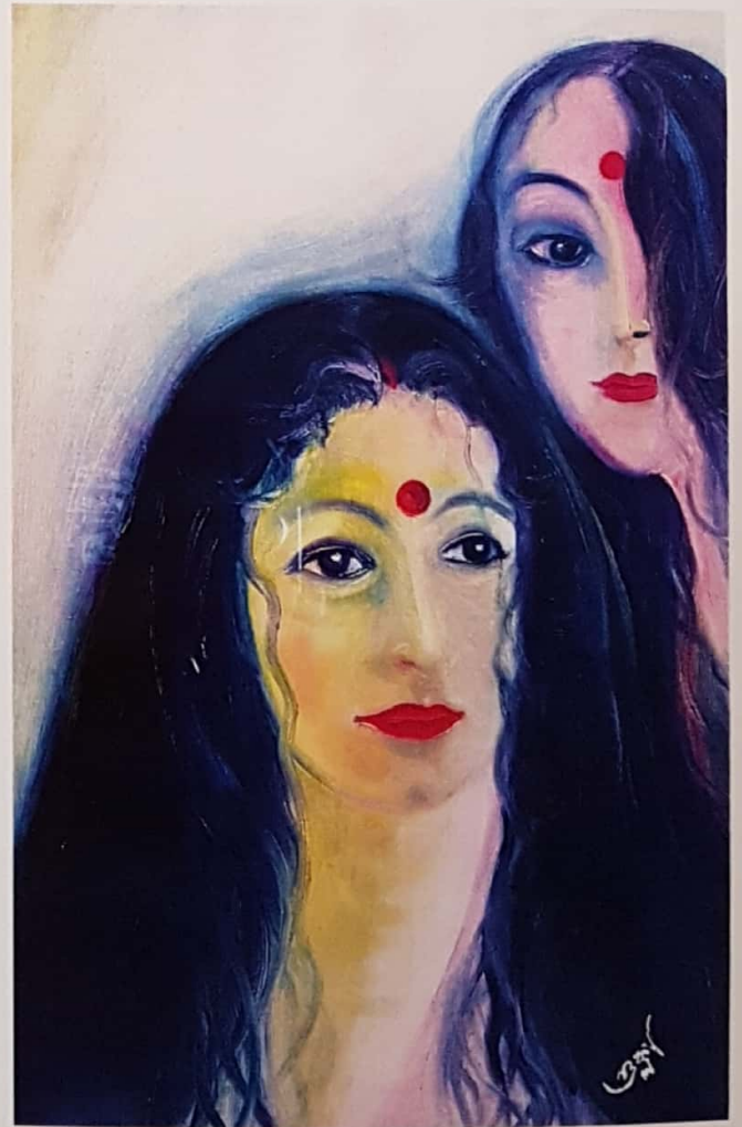
Damini | 14" x 22" | Oil on Paper