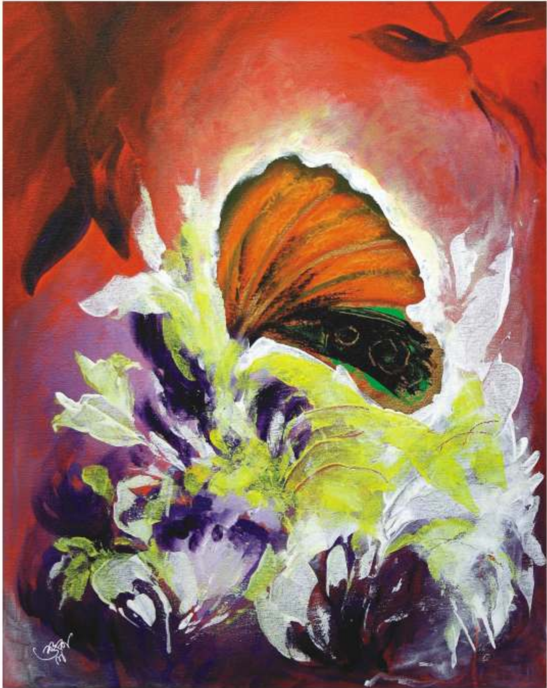
Velvet Wings 1 Acrylic on Canvas