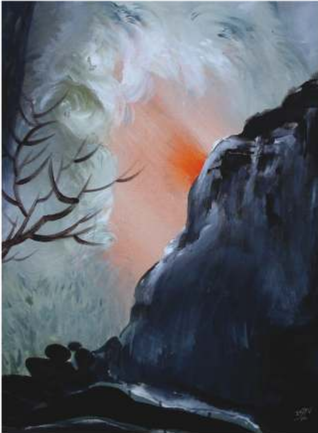
Path to the Himalayas Acrylic on Canvas