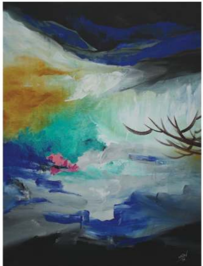
Gangotri Acrylic on Canvas

"... Shukla's overwhelmingly large canvases seem to be passionate celebrations of nature's beauty. It's probably this very uninhibited approach towards her craft, which makes Shukla's canvases stand out." The Indian Express