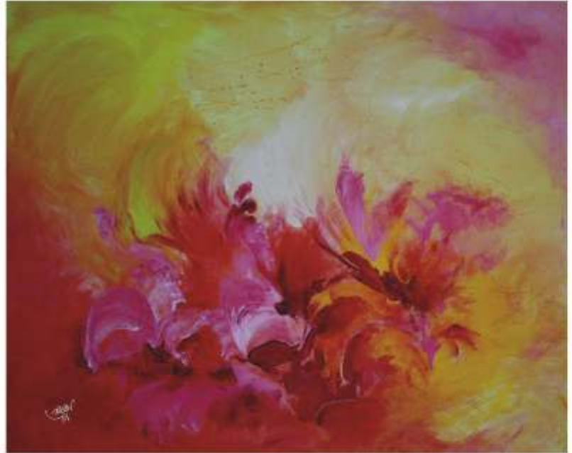
Utopia Acrylic on Canvas