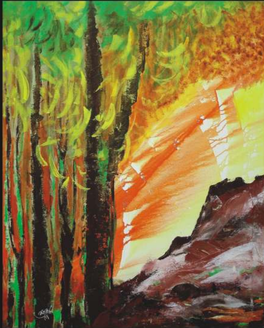
Enchanting Acrylic on Canvas