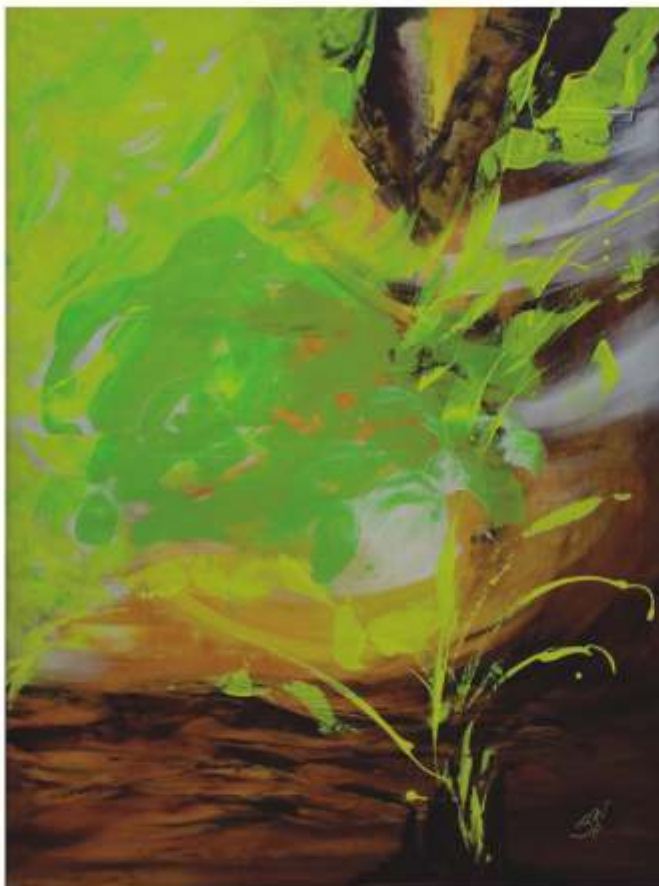
I am Free Acrylic on Canvas