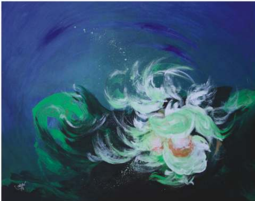
Ecstasy Acrylic on Canvas