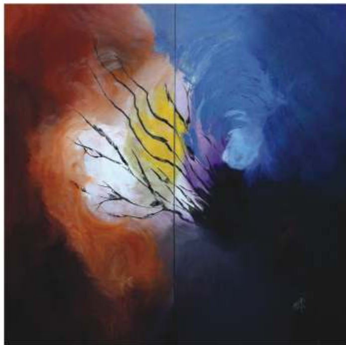
Into the Deep Blue Sea Acrylic on Canvas