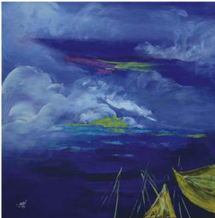
Interlude Acrylic on Canvas