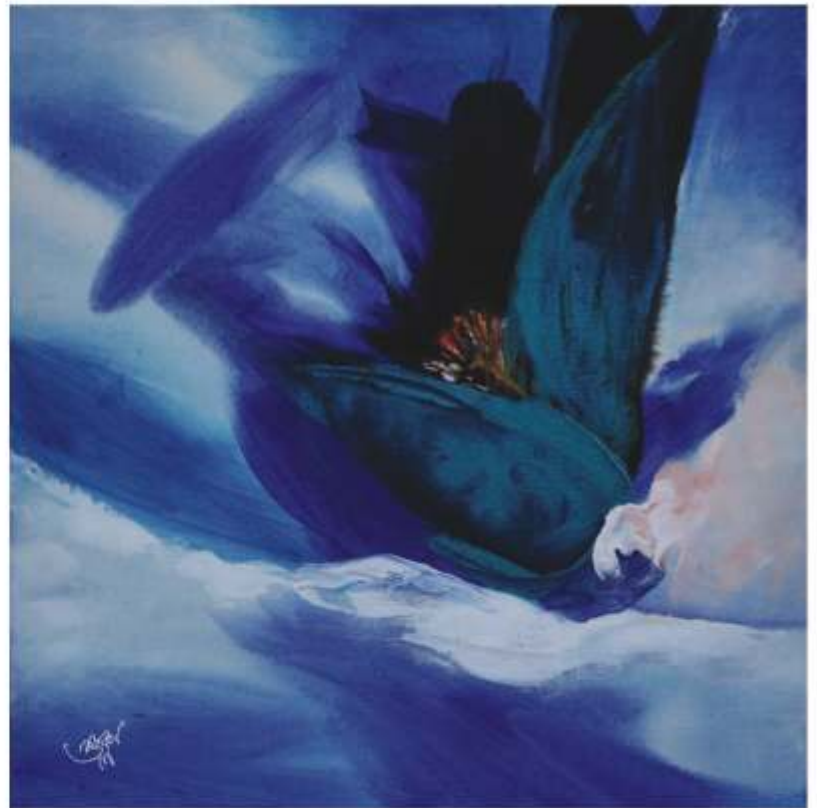
Majestic Acrylic on Canvas

"There were no staid greys or whites. They were angry reds, fighting greens, dying-to-break-free blues. They did not want to be contained by lines; only to flow into ach other, around each other." Bombay Times | The Times of India