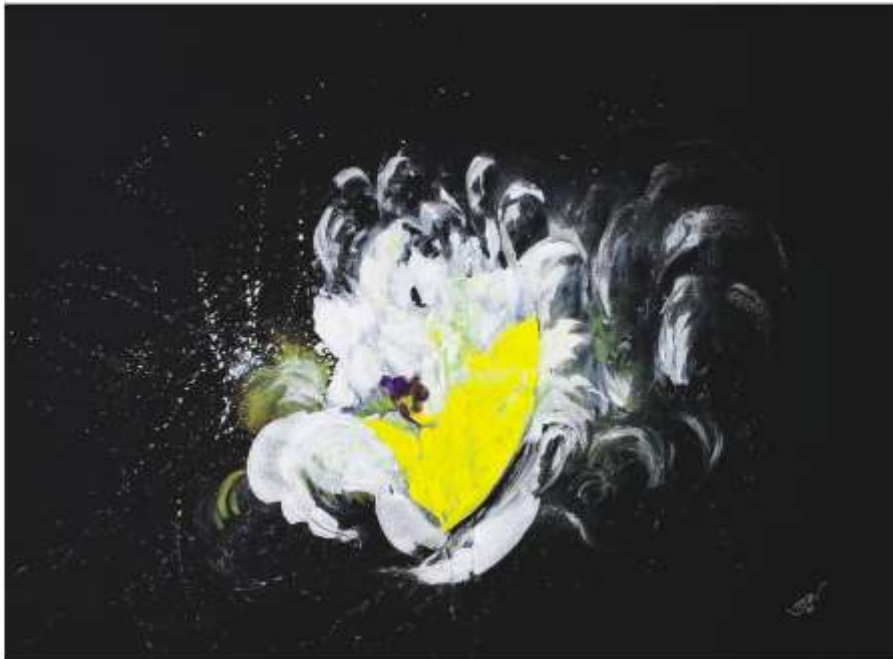
One is Great Acrylic on Canvas