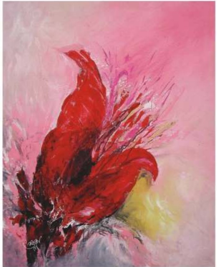
The First Nectar Acrylic on Canvas

"Her works reveal to the viewer too, that there is a hidden beauty in everything and everyone. The exhibitions pay obeisance to nature and lay emphasis on the connection with 'the one supreme being'" Delhi Times | The Times of India