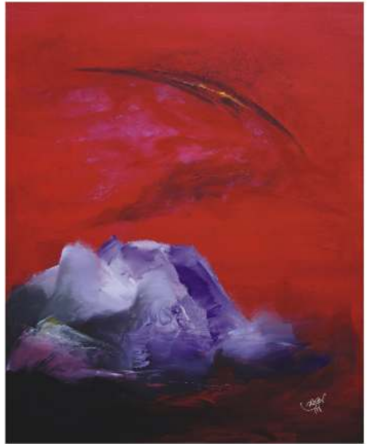
Paradise Regained Acrylic on Canvas